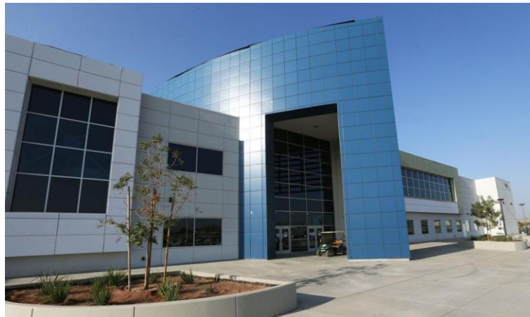
1The Career Technical Education Center on Old River Road, home to several of our Early College courses with KHSD.

Dual enrollment has existed between the two institutions since 2015. Now, they have gone a step further, launching an associate degree completion program online in fall 2020, further closing equity gaps, and increasing baccalaureate attainment rates. Students in the Kern High School District can enroll until March 26 to get a 2-year head start on their baccalaureate degree, with books and transportation provided to them through BC's Early College program.