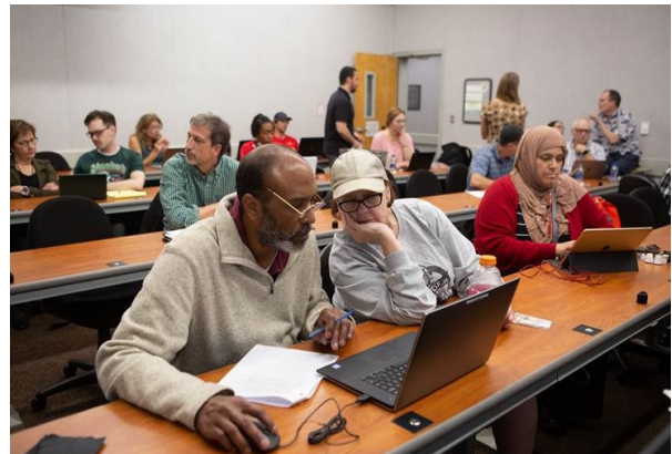
BC faculty training with Academic Technology to transition their courses