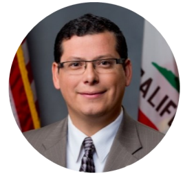
Rudy Salas California State Assembly