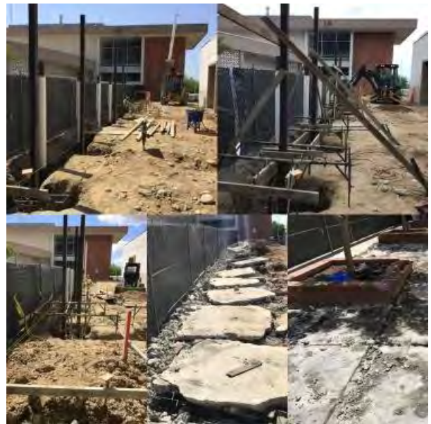
Construction taking place on the Veterans Resource Center