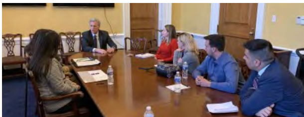
BCSGA Officers speak with Congressman Kevin McCarthy in his Washington, DC Office.

The ASACC also provided the opportunity for BC's students to speak with representatives from Congress Member Barbara Lee's Office, Congress Member Garamendi, and Congress Member, Kevin McCarthy.