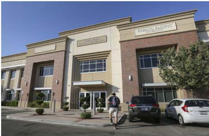
Bakersfield College Southwest and Fresno Pacific University are campus mates at 11000 River Run Blvd.