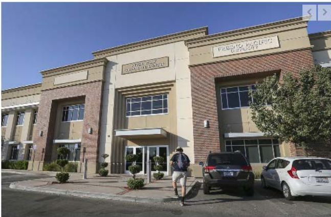
Bakersfield College Southwest and Fresno Pacific University are campus mates at 11000 River Run Blvd.