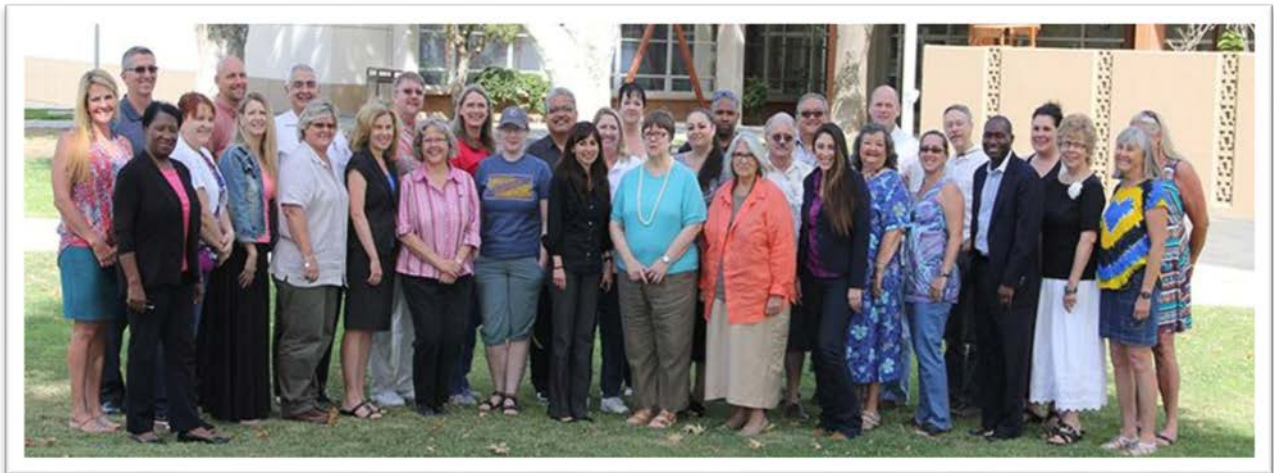
Accreditation Boot Camp May 2014

In addition to broad engagement, the College made the process as transparent and open to the community as possible by posting the work of the teams on the Midterm 2015 page: https://www.bakersfieldcollege.edu/employees/accreditation