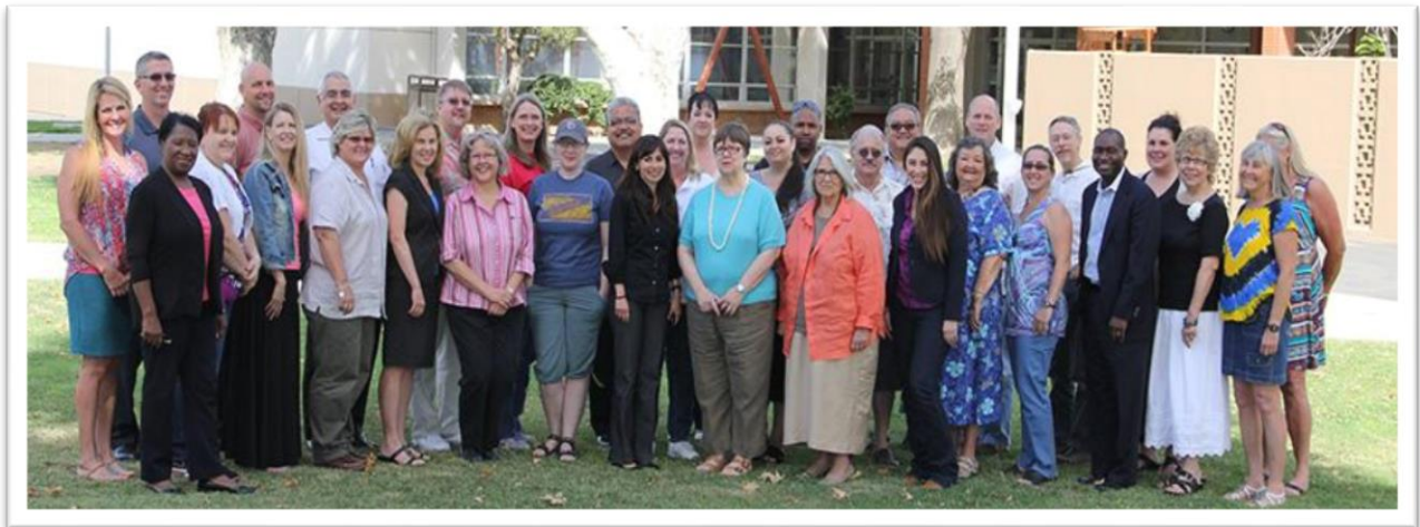
Accreditation Boot Camp May 2014

In addition to broad engagement, the College made the process as transparent and open to the community as possible by posting the work of the teams on the Midterm 2015 page: https://www.bakersfieldcollege.edu/employees/accreditation